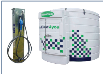
Tanks and dispensing post