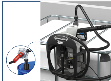
PUMP for your IBC & Drums