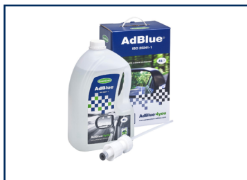
4L Starter Kit