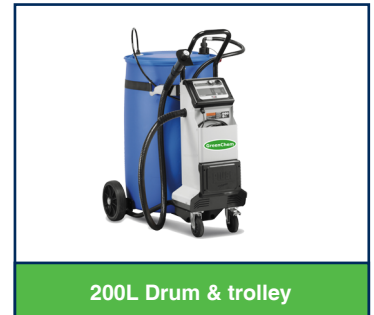
200L Drum & trolley