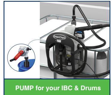
PUMP for your IBC & Drums