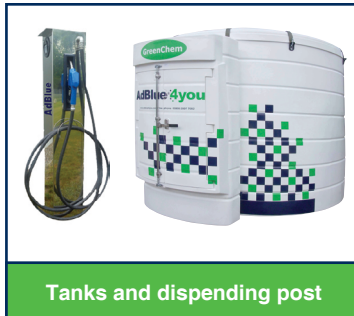
Tanks and dispensing post