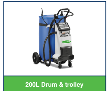
200L Drum & trolley